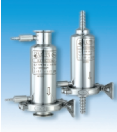
Left: ZLK702G10NKH4 Right: ZLK702G23LHKH4